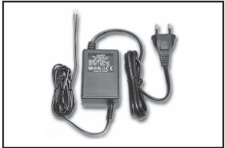
Figure 2: PT3E Power Supply